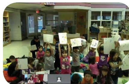
Young Black Lake school students participating in “Dot Day” via Connected North.